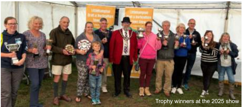
Trophy winners at the 2025 show

Littlehampton Town Show and Family Fun Day 2027 Saturday 11th September 2027